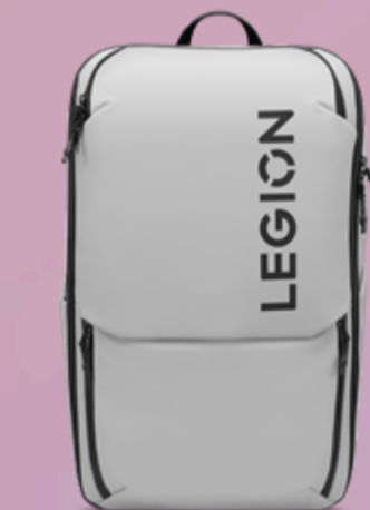
Lenovo Legion 17" Gaming Backpack GB800 (Light Gray) GX41U39300

Please click here to view the full list of accessories.