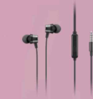
Lenovo Analog In-Ear Headphones Gen II Bulk Package (20pcs) 4XD1T54899